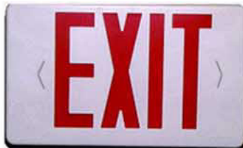
Exit Sign WDE-600B (B&W) WDE-600C (color) (Fully functional) * design of housing subject to change without notice